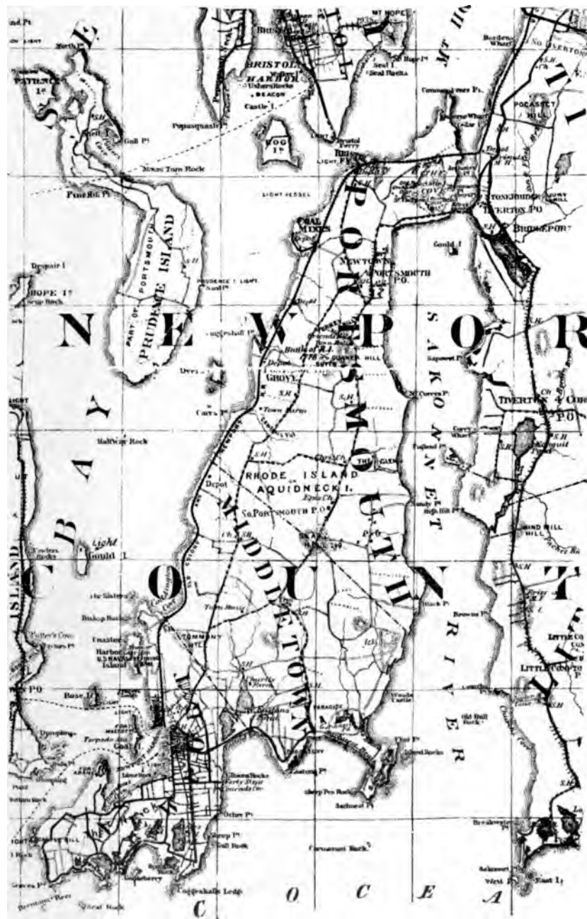
THE AQUIDNECK PURCHASE, 1638 COLONY OF RHODE ISLAND, 1640